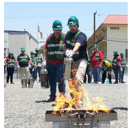
Fire suppression safety

WHEN: December 15 th , 16 th , 17 th , 2017 (All three days required Fri. Sat. & Sun.)