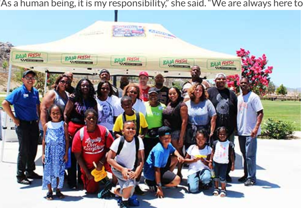
Students from kindergarten to high school benefitted from the July 25 backpack giveaway at May Ranch Park.

"As a human being, it is my responsibility," she said. "We are always here to serve."