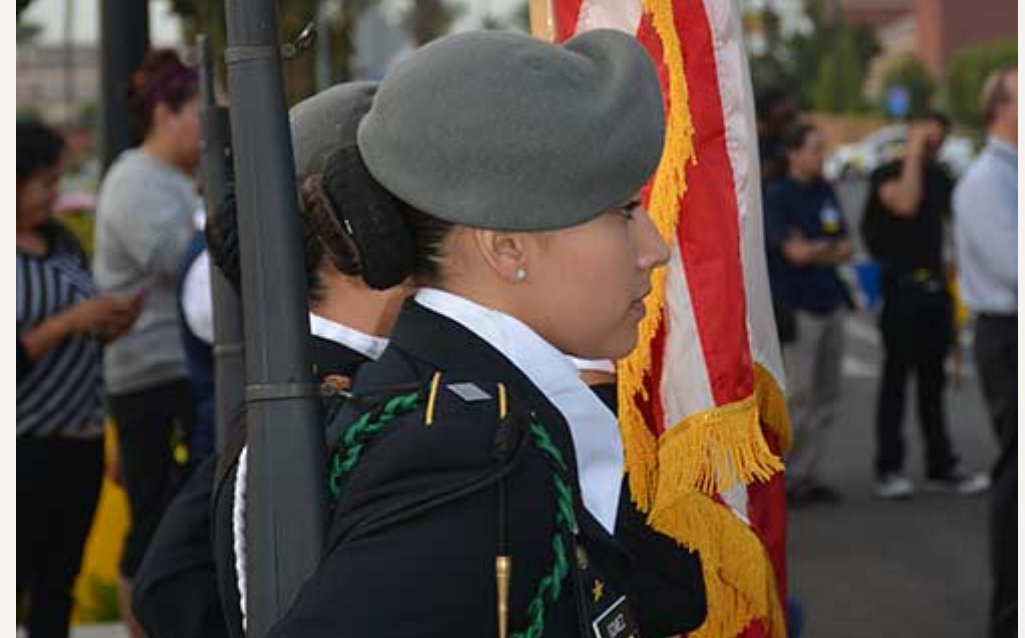
The Perris High School Army ROTC provided the Color Guard for Wednesday's ceremony.

The new Walmart replaces a smaller, existing store that opened in 1992, the first Walmart in Riverside County. Construction crews broke ground at the Supercenter site about 14 months ago.