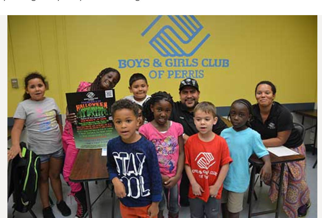
Members of the Boys & Girls Club are pictured during a recent morning at the clubhouse on the City Hall Campus. The club and the City of Perris are hosting a 5-kilometer walk/run on Halloween to raise funds for after-school activities.

The City of Perris is sponsoring the "Spooky Walk/Run", which is part of its ongoing Live Well Perris health initiative, which emphasizes improving the quality of life through exercise and smarter food choices.