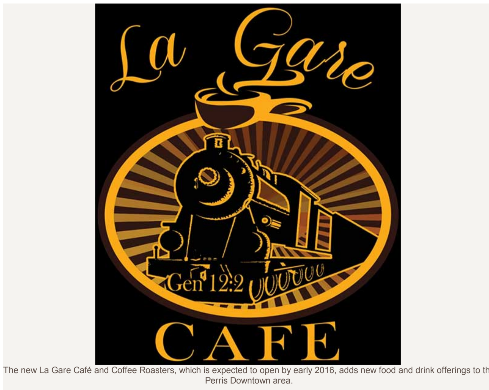
The new La Gare Café and Coffee Roasters, which is expected to open by early 2016, adds new food and drink offerings to the Perris Downtown area.