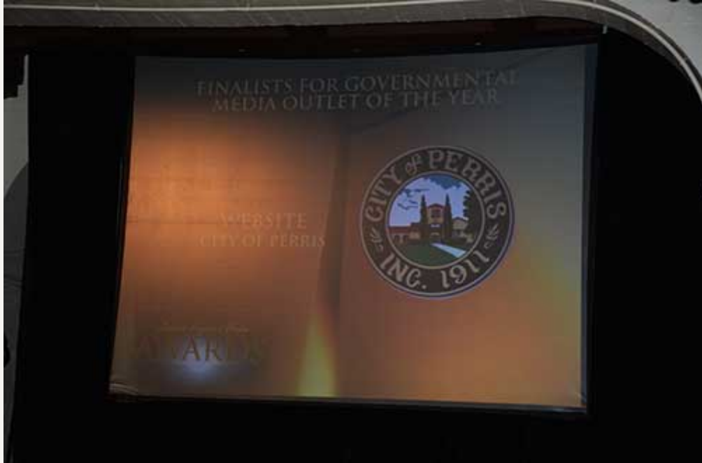
The logo for the City of Perris flashes on a big screen prior to the announcement of the municipal website winning honors from the American Advertising Federation.