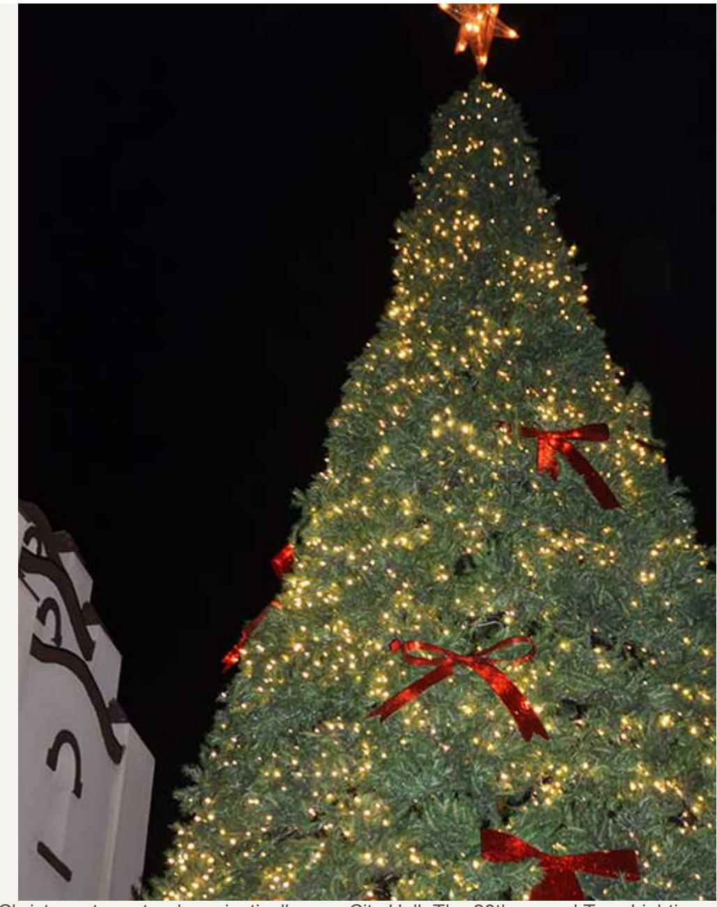
The City of Perris Christmas tree stands majestically over City Hall. The 28th annual Tree Lighting ceremony takes place Saturday, Nov. 28 at 6 p.m. at City Hall, 101 North D Street.

The evening's activities also include the arrival of Santa Claus on a fire engine, Polynesian dancers, participants in the "Perris Got Talent" contest, Boy Scouts, chorale groups and church choirs. Food and holiday-merchandise vendors also will be on hand. Everyone in attendance will receive complimentary desserts and hot chocolate.