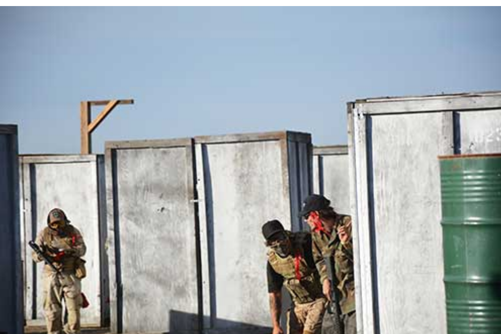
Competitors move through an airsoft scenario during a recent Saturday at the Action Star Games complex in Perris.

Anywhere from a handful to dozens of players can take part in paintball or airsoft competitions. Typical matches last 20 minutes or less, allowing for a large number of contests during a single day's play.