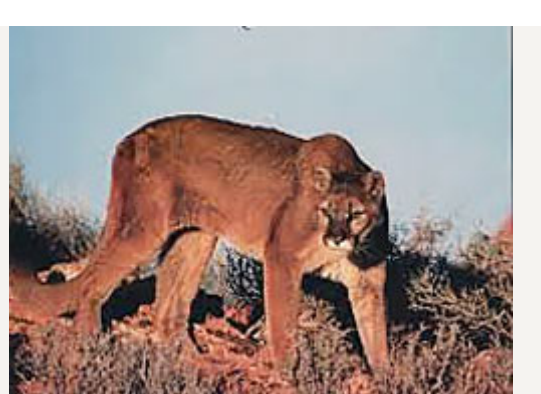
Above is a photo of a full-grown mountain lion.