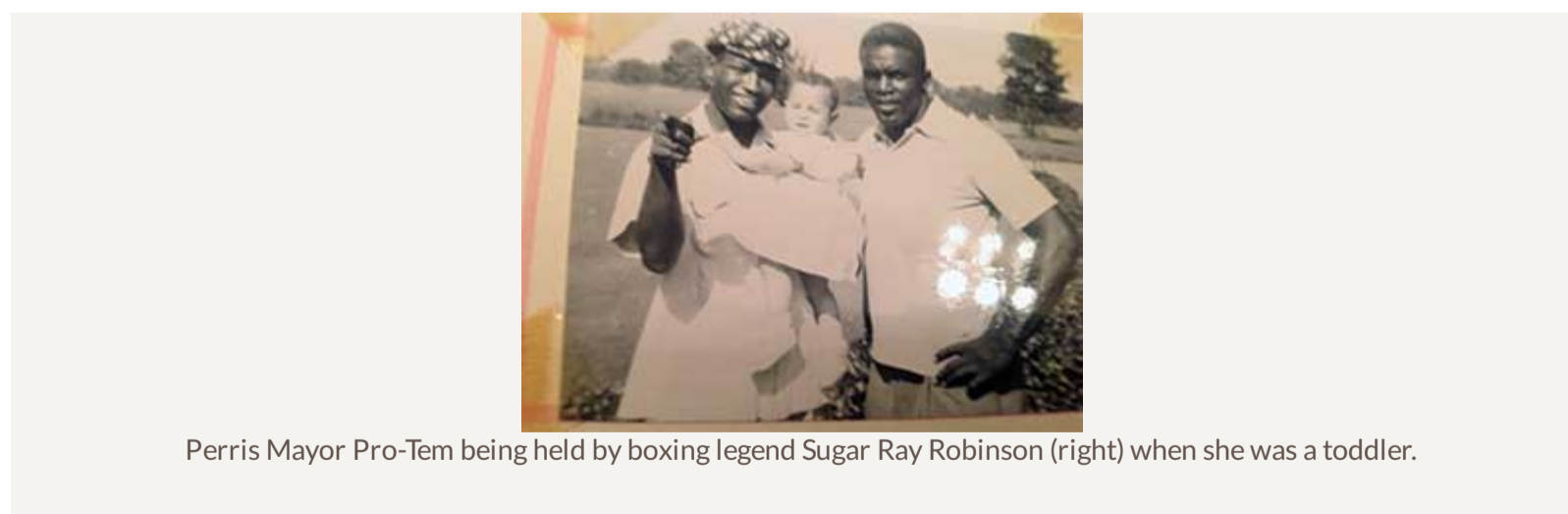
Perris Mayor Pro-Tem being held by boxing legend Sugar Ray Robinson (right) when she was a toddler.