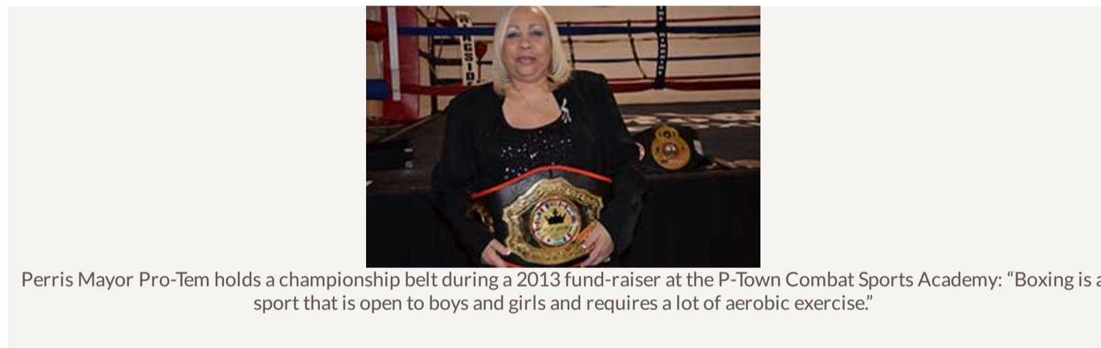
Perris Mayor Pro-Tem holds a championship belt during a 2013 fund-raiser at the P-Town Combat Sports Academy: "Boxing is a sport that is open to boys and girls and requires a lot of aerobic exercise."

"It's time to knock out diabetes, high-blood pressure, cholesterol and heart disease!" she said. "Boxing is a sport that is open to boys and girls and requires a lot of aerobic exercising and training that gets the heart muscles pumping," she said. "The skills clinic will introduce kids to boxing skills, provide a wonderful way to get exercise and have fun and introduce them to a great sport."