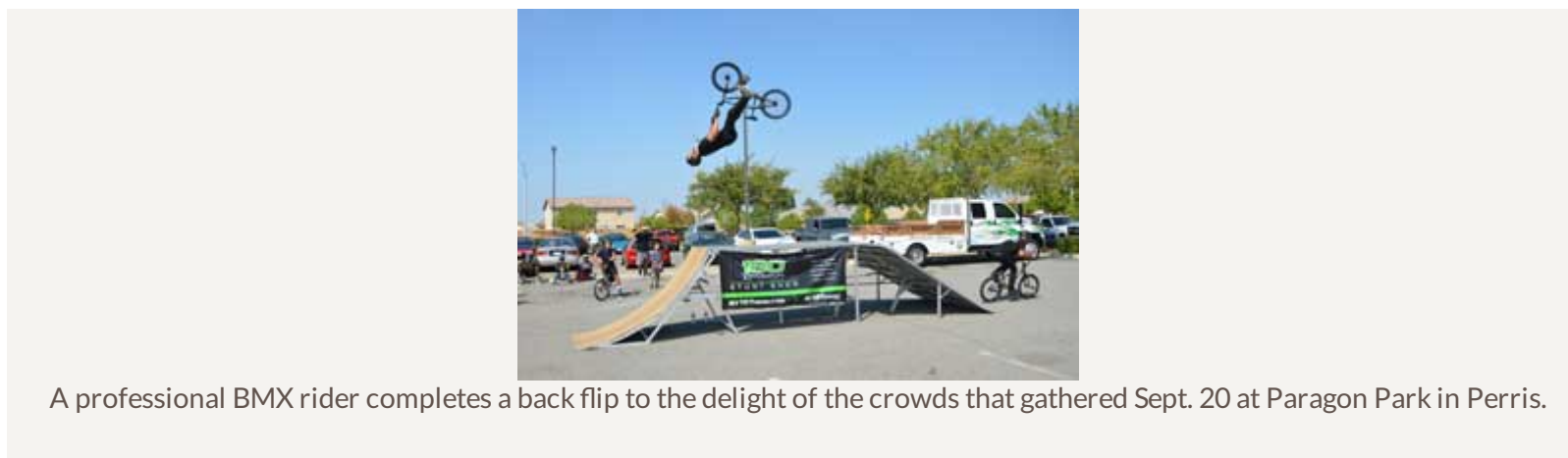
A professional BMX rider completes a back flip to the delight of the crowds that gathered Sept. 20 at Paragon Park in Perris.