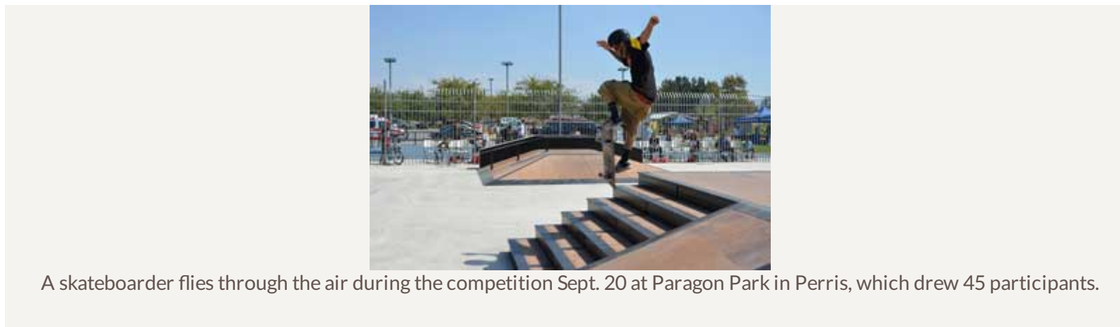
A skateboarder flies through the air during the competition Sept. 20 at Paragon Park in Perris, which drew 45 participants.