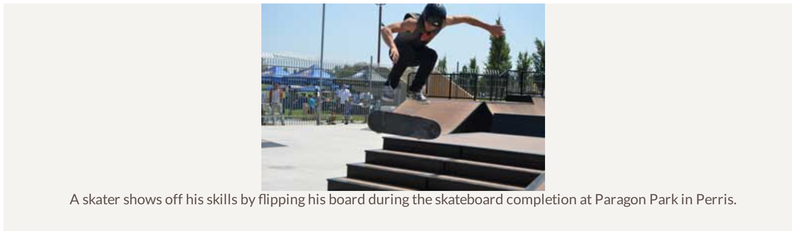
A skater shows off his skills by flipping his board during the skateboard completion at Paragon Park in Perris.