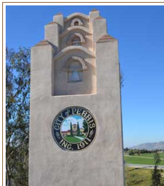
The improvements at the Interstate 215/Ramona Expressway interchange also include the creation of a decorative tower featuring Perris' logo.