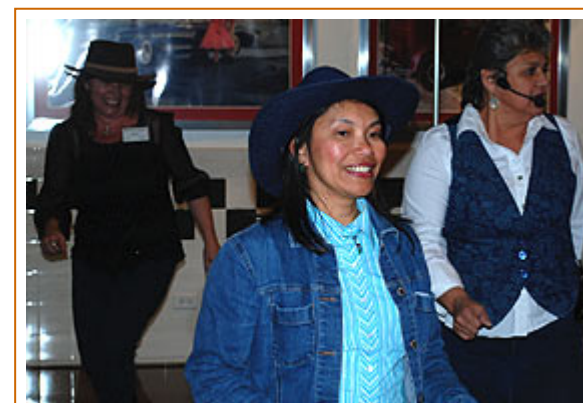
Line-dancing lessons were provided as part of the entertainment at the 2012 Perris Valley Chamber of Commerce Business Awards and Installation Dinner.