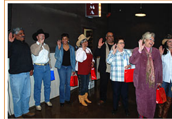
The Chamber of Commerce Board takes the oath of office.