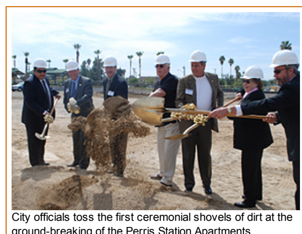
ground-breaking of the Perris Station Apartments Wednesday afternoon.

About $6-million of the funding will come from City redevelopment money with the rest coming from private-development monies and federal tax credits.