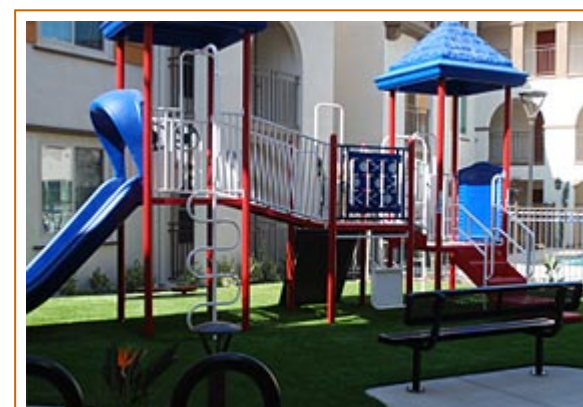
Playground equipment for children is among the amenities at the Mercado complex, which is expected to open within 60 days.