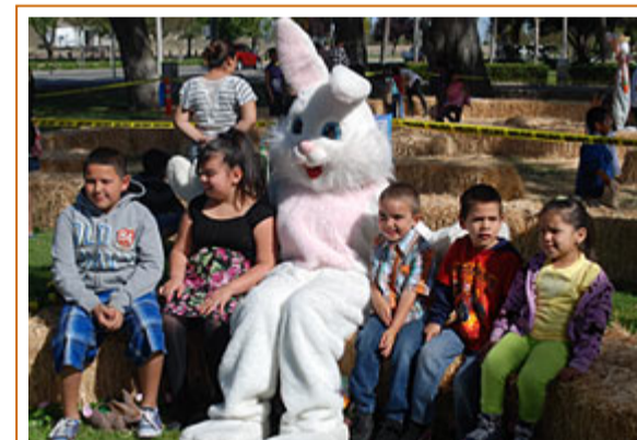
Many families took advantage of the opportunity to have a picture with the Easter Bunny.