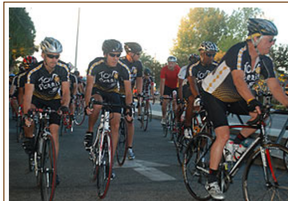
Riders take off from Perris City Hall at the start of the 2011 Tour de Perris.

A webpage detailing prices to register and other pertinent