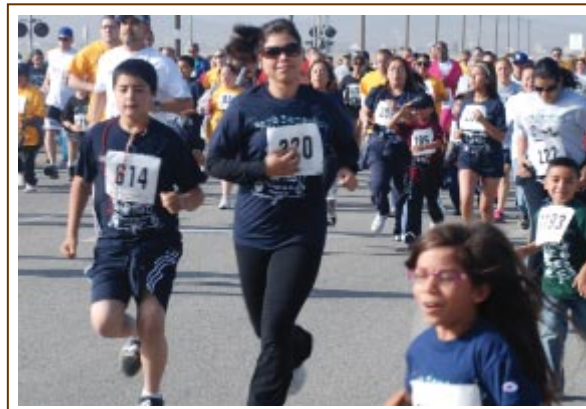
Dozens of runners take off at the start of the 5-kilometer (3.1 mile) Fun Run.

HanesBrands Inc. to provide 2,000 t-shirts in a rainbow of colors to all participants. After the run, boxes of new socks also were distributed.