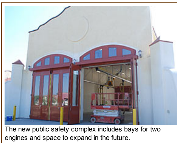
The new public safety complex includes bays for two engines and space to expand in the future.

"As we grow, we need to continue to improve our public safety and this new fire station and emergency operations center shows our commitment," Landers said. "Perris continues to be a progressive and aggressive City."