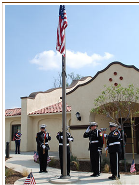
Members of a Cal Fire honor guard lower the flag to half staff during the dedication of the new fire station/emergency operations center at 105 South F Street.