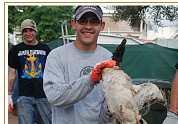
Volunteers found a mummified duck at one location.