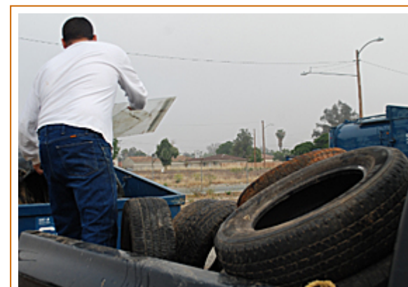
Discarding tires proved popular for many Perris residents during the big annual Spring Clean-up.