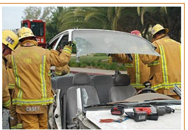
Perris firefighters practiced extricating a victim trapped inside a damaged car during the National Night Out at Perris City Hall.