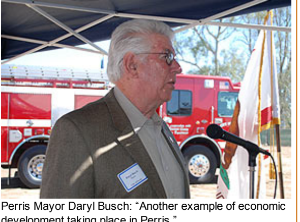
Perris Mayor Daryl Busch: "Another example of economi development taking place in Perris."