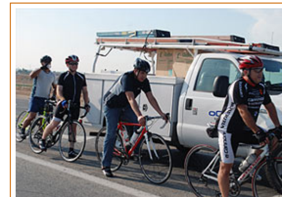
Perris City workers during a recent training ride in preparation of the Oct. 1 Tour De Perris, a 100-mile ride through southwest Riverside County.