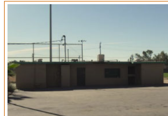
Before image of the concessions building at Bob Long Memorial Park in Perris.