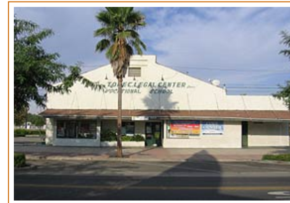
Todec Legal Center before its transition.