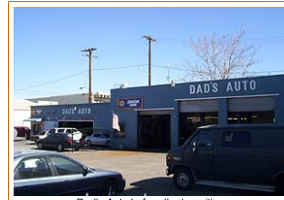
Dad's Auto before the transition.

"The changes will be dramatic," she said. "It's going to reshape the area."