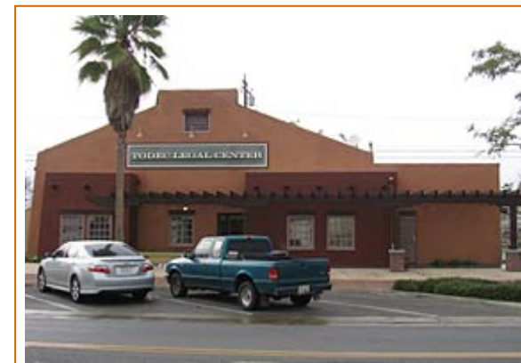
Todec with its new façade.