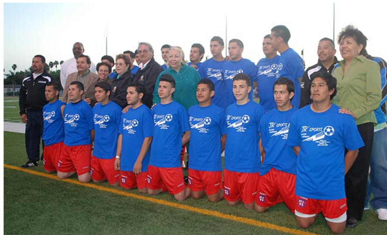
Dignitaries pose with the local squad

The Perris High School football stadium shook, rattled and rolled as more than 3,000 people came to an international soccer match that pitted a group of local players against a squad of retired professionals from Mexico.