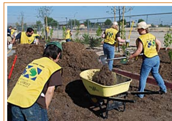
Mormon Church volunteers spread mulch at Patriot Park.