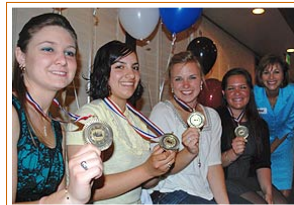
The winners with medallions presented to them.