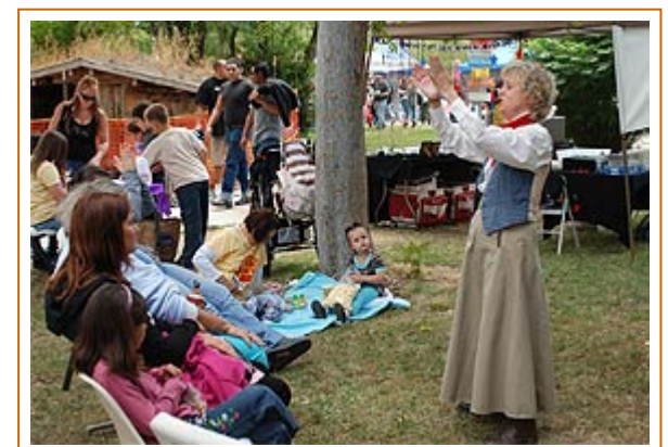
during last year's event.