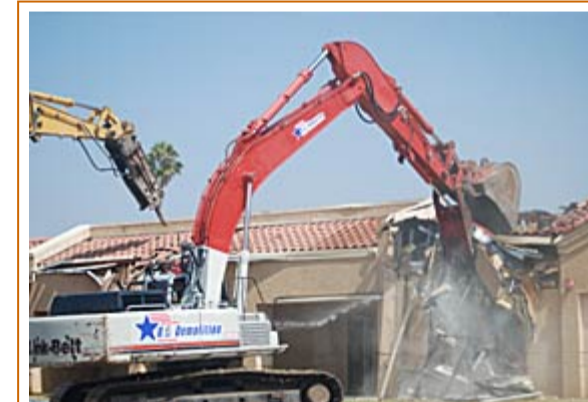
A huge crane makes quick work in demolishing a former Air Force child care center.