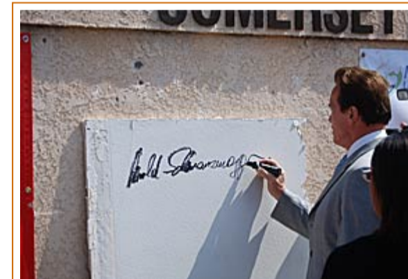
Schwarzenegger signs his name, giving his approval for the demolition to begin.