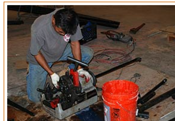
A workman cuts pipe at the market, which will employ 80 workers and is expected to generate $10.4 million in annual sales.