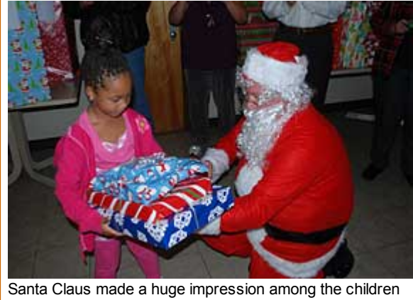
living at the Path of Life Ministries and Amelia's Light.