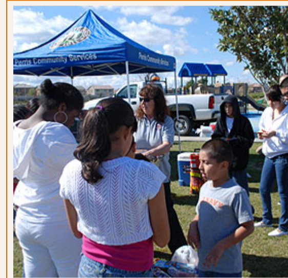
City Staff conduct a raffle for prizes like puzzles and Play-Doh.