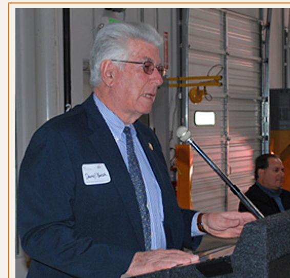
Perris Mayor Daryl Busch addresses the crowd at the grand opening of the Hanesbrands distribution center.