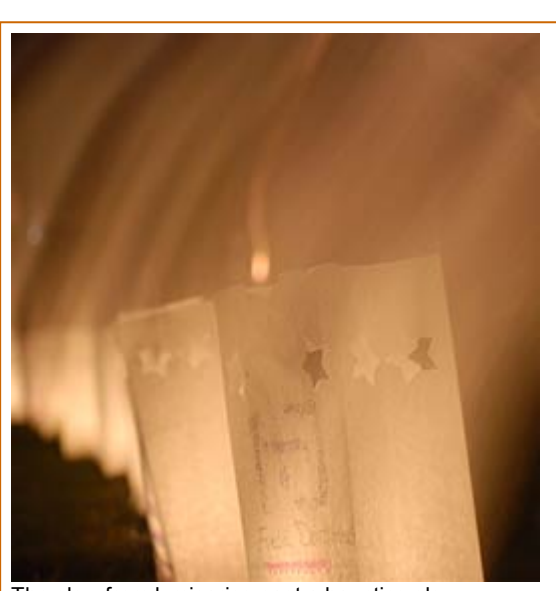
The glow from luminaries cast a haunting glow on the night sky.