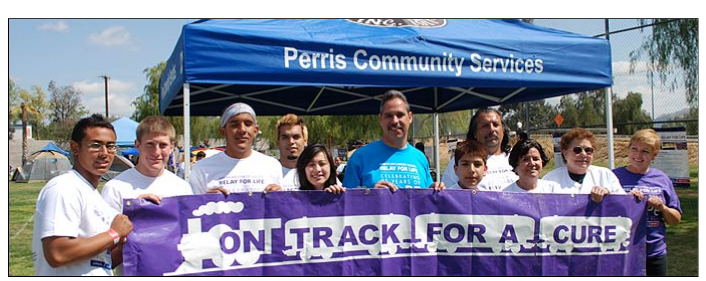
The City of Perris team helped raise $3,000 for cancer research and treatments.

They walked for their moms and dads and sweethearts, for their children and friends, for themselves and for strangers. People turned out in droves for Perris' annual "Relay For Life," the annual walk to raise funds for research and treatment of cancer.