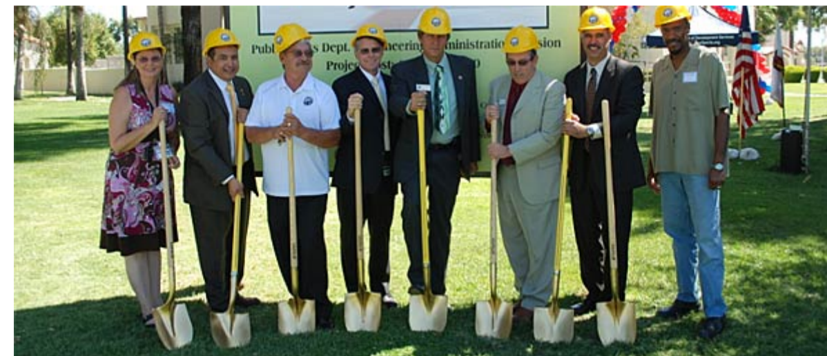
City elected officials and other dignitaries at the ceremonial ground-breaking.

Pride, progress and partnerships were the themes of the day as Perris officials broke ground on a road improvement project that will serve as a gateway to the City's unique and priceless historical Downtown region.