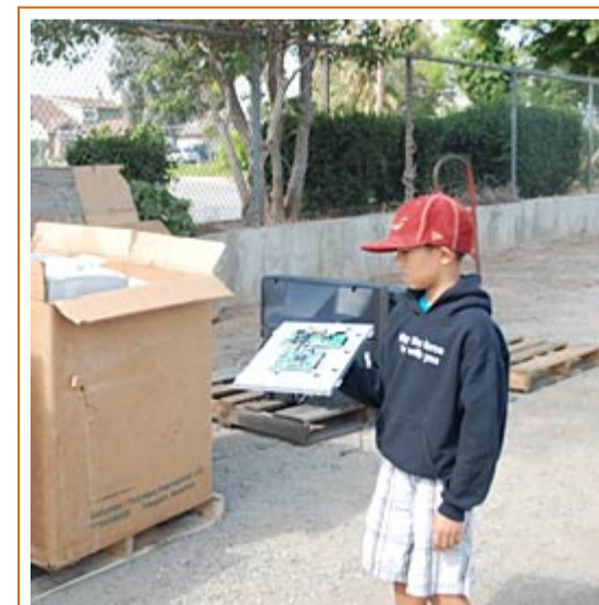
A young environmentalist carries a circuit board to the recycle bin.