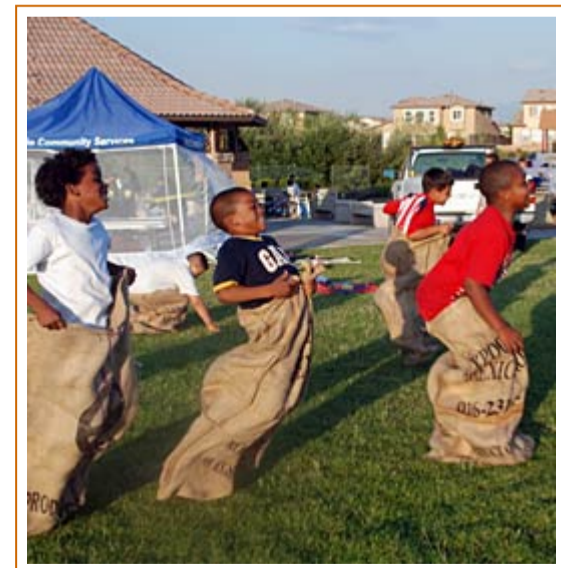
These energetic youngsters took part in a sack race prior to the showing of the movie "Wall-E."