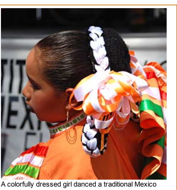
favorite during the TODEC festival.