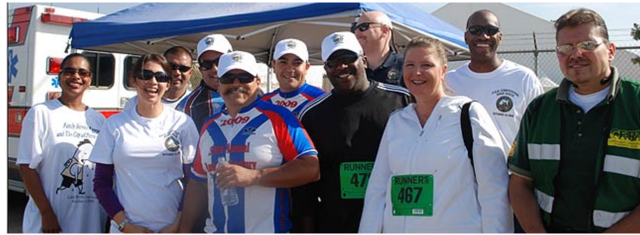
Perris Municipal Workers represented the City well

More than 150 bicyclists, runners and walkers came to Lake Perris over the weekend to get in their exercise while raising money for a great cause.