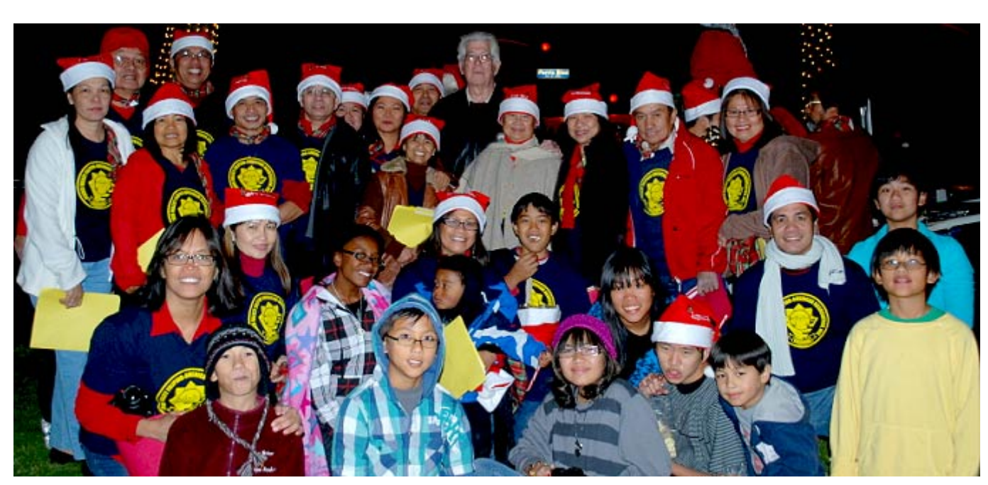
The Mayor with members of the Filipino choir.

More than 1,200 enthusiastic people came to Perris City Hall Friday to witness the annual Christmas tree lighting ceremony, the event that kicks off the City's holiday season.