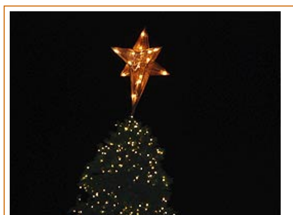
The star atop the City's 40-foot Christmas tree lit up the night. The 22nd annual tree-lighting cerermony drew more than 1,200 people.

The event, the 22nd annual Tree Lighting Ceremony, also featured performances from local school children and civic groups. Old St. Nick put in an appearance, posing for the young and young at heart and taking orders for Wiis, Game Boys and other electronic toys. He handed out candy canes.