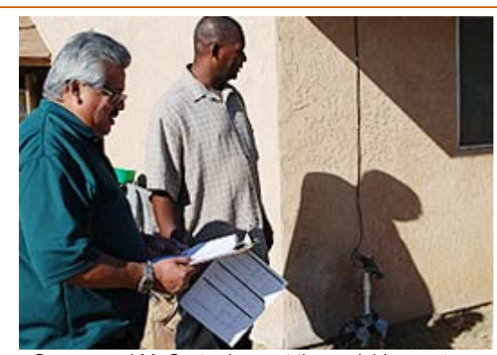
which could be replaced with grant funding from the Green Light for Savings Program.

Earlier this year, Perris installed a demonstration garden at City Hall that will save hundreds of thousands of gallons of water annually. The City also is committed to planting hundreds of trees to provide shade and reduce its carbon