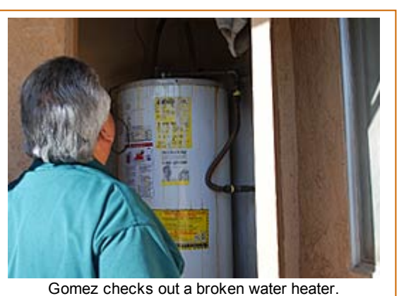
Gomez checks out a broken water heater