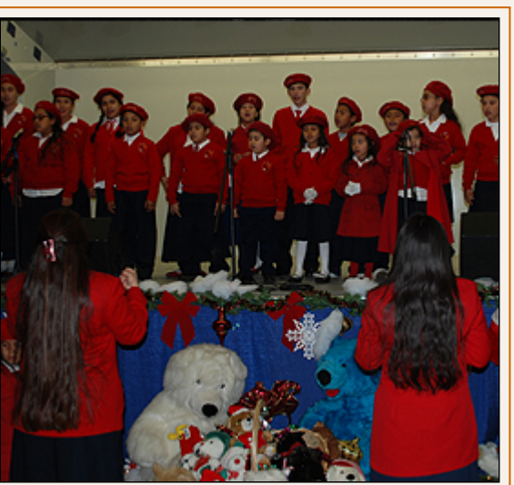
A kids choir belts out holiday favorites.

"We still maintain that small town sense of community," he said. "We do a lot of things for the residents. We haven't outgrown ourselves."