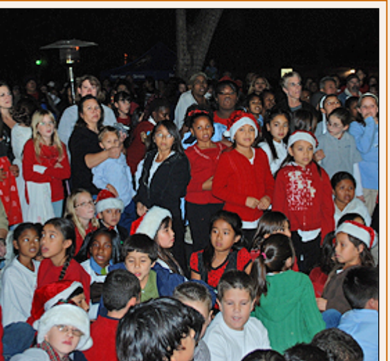
Throngs of people came to the annual tree-lighting ceremony at Perris City Hall on Dec. 5