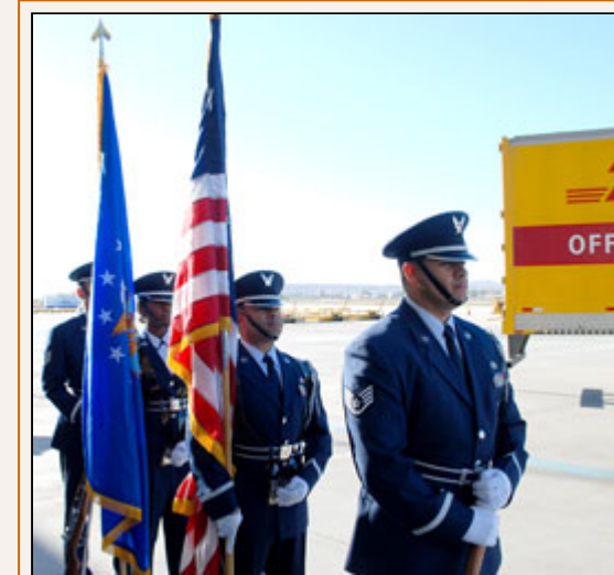
A March Air Reserve Base honor guard carries the flag during the DHL "Trees for Troops" ceremony.