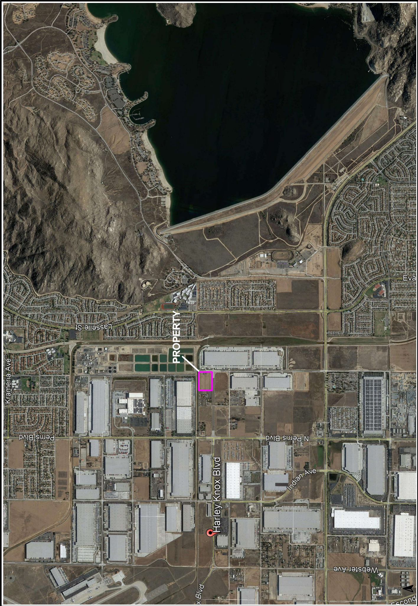
FIGURE 1 Location Map