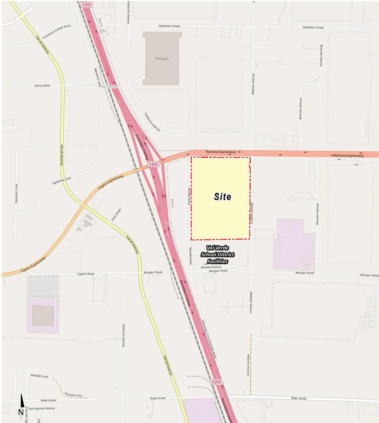
EXHIBIT 1-A: LOCATION MAP