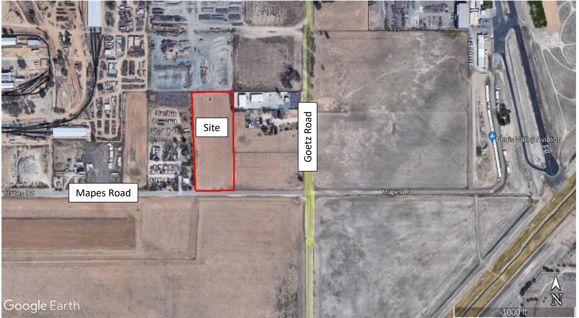
Exhibit A Location Map