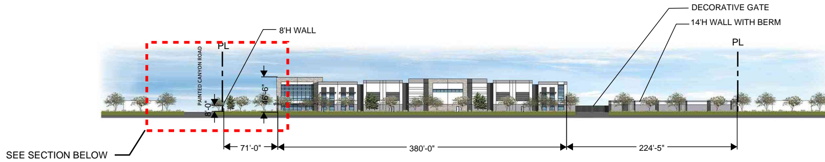
EAST - WEST SECTION