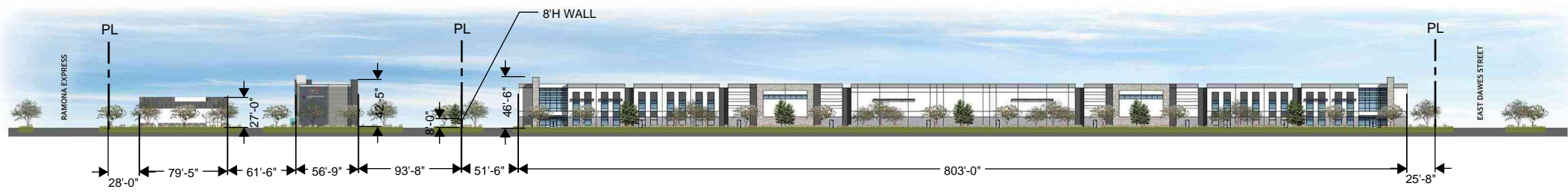
NORTH - SOUTH SECTION