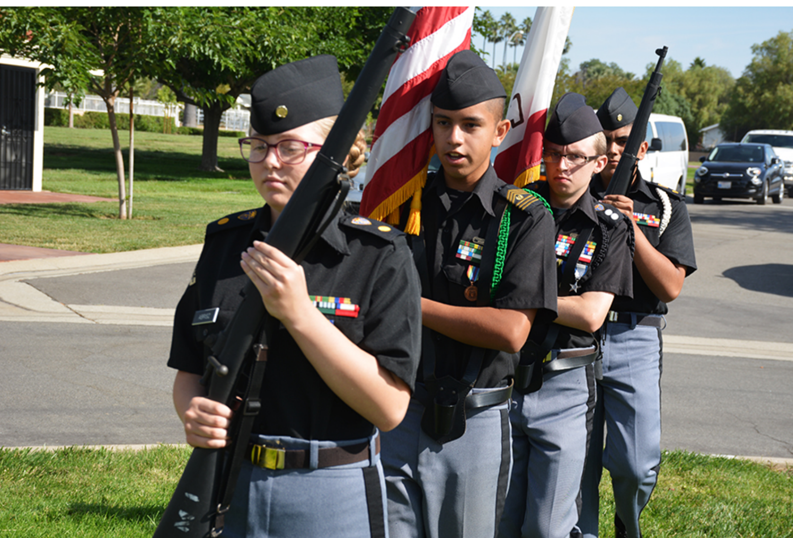
Cadets from the California Military Institute in Perris serve as the Color Guard during the 2017 Memorial Day remembrance at the Perris Valley Cemetery. This year's ceremony takes place Monday, May 28, at 8:30 a.m.