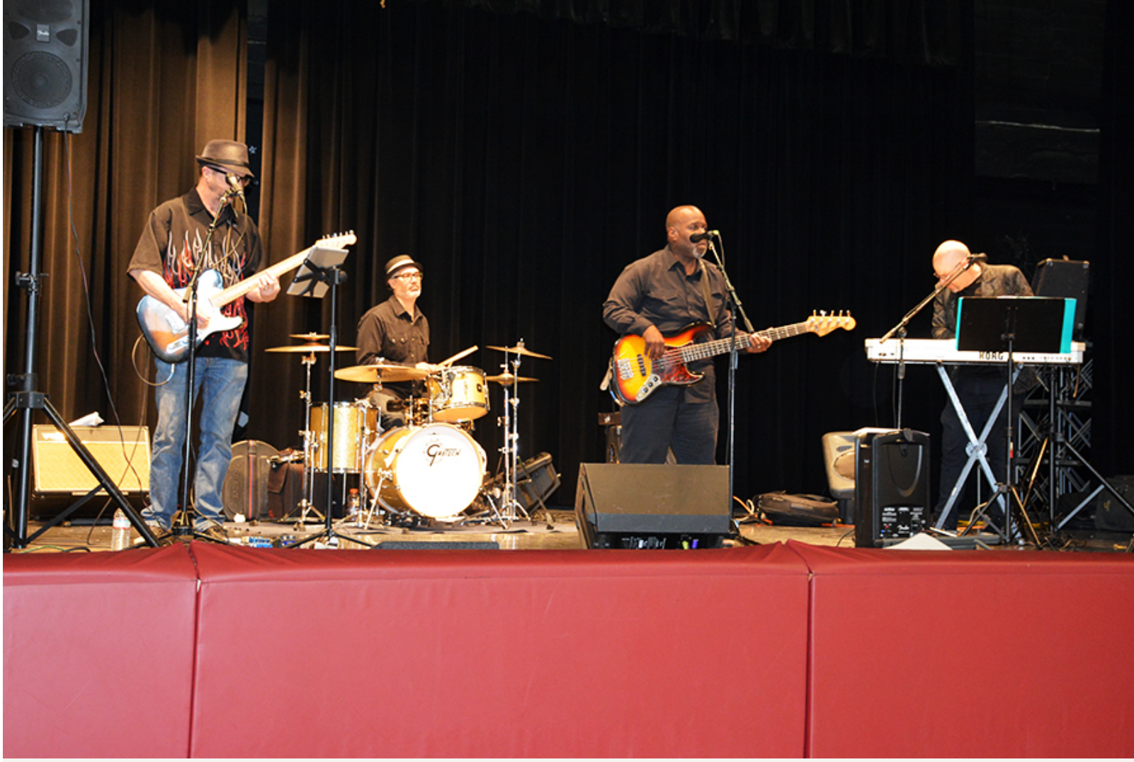
Musical entertainment during the Senior Prom was provided by Dock Rock It.

"We've worked hard all our lives and now that we are retired, we look forward to these kind of events," he said. "The City of Perris is wonderful. We love the Senior Prom because for the food, the music, the dancing and to see friends. It's a fun place to be."