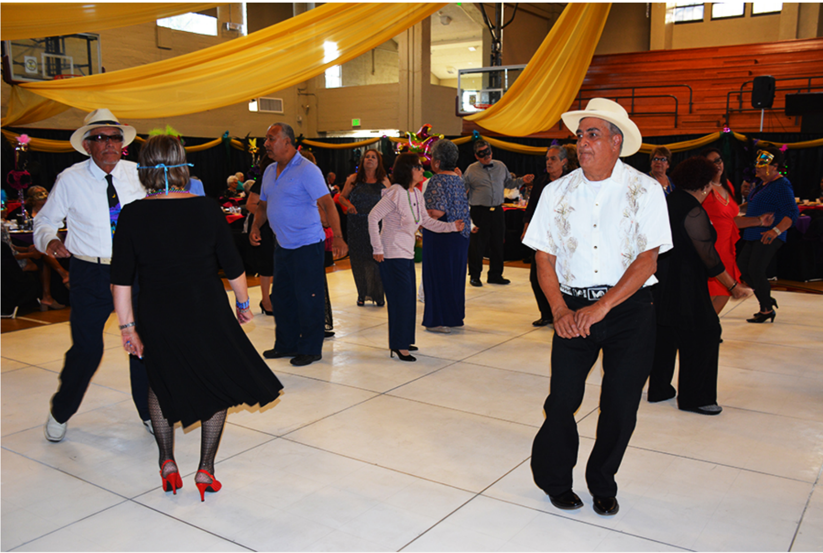
Perris seniors hit the dance floor May 19 during the 5th Annual Senior Prom at the Bob Glass Gym. This year's extravaganza attracted about 300 people.

The retirees, grandparents and great grandparents took to heart the theme of the annual Senior Prom sponsored by the City of Perris.